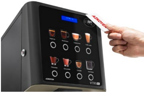
RFID Reader Kit For product recharge card or cashless systems