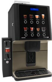
Validator module kit Ready to install a coin validator.