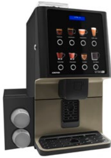
Cup module kit For dispensing cups.