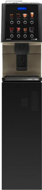
Base cabinet kit Ready to install a coin validator. (850 mm.)

It is also the perfect solution for a coffee service in convenience stores as well as for hotels, where breakfast needs to be good but also fast. It offers a pleasurable experience with an attractive, simple and functional design.